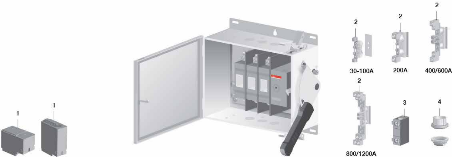
1 Terminal shrouds | 2 Neutral assembly (for switch size) | 3 Auxiliary contact block | 4 Hub