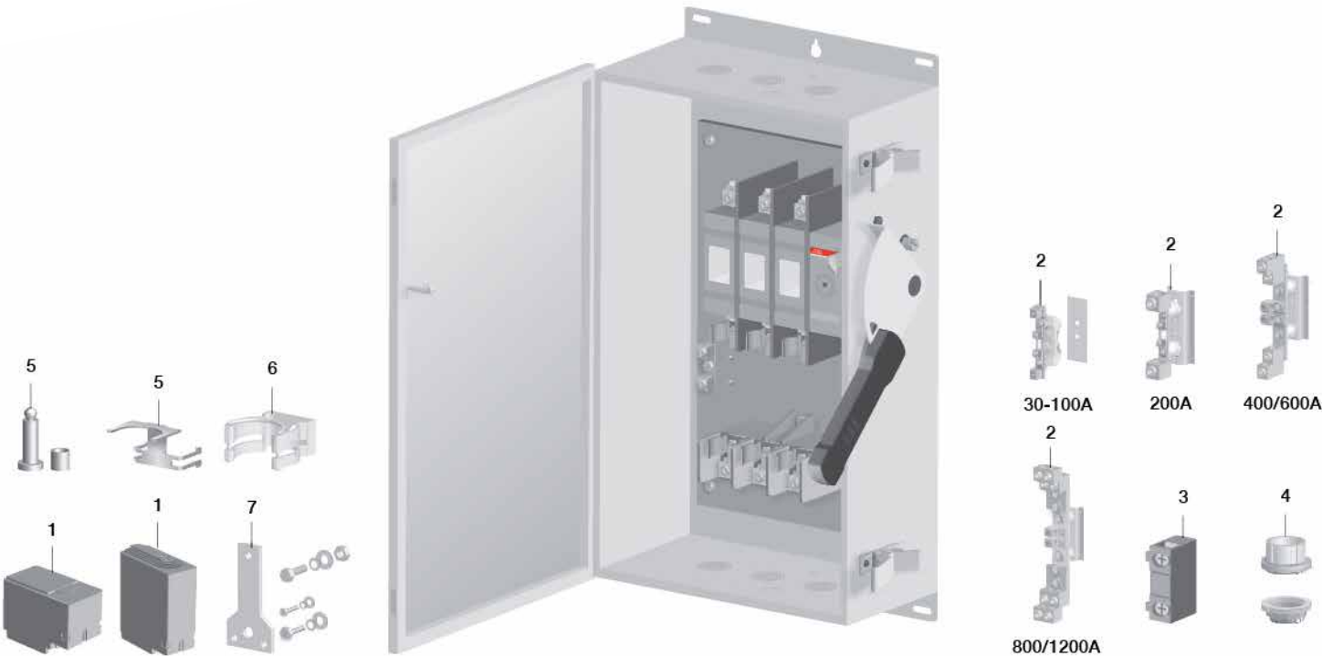
1 Terminal shrouds | 2 Neutral assembly (for switch size) | 3 Auxiliary contact block | 4 Hub | 5 Rejection members | 6 Fuse clip (T 60A) | 7 Fuse mounting bolt kit (T and J fuses)