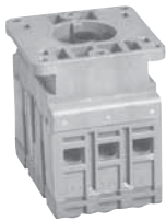
OT16ET3 OT25ET3 OT32ET3