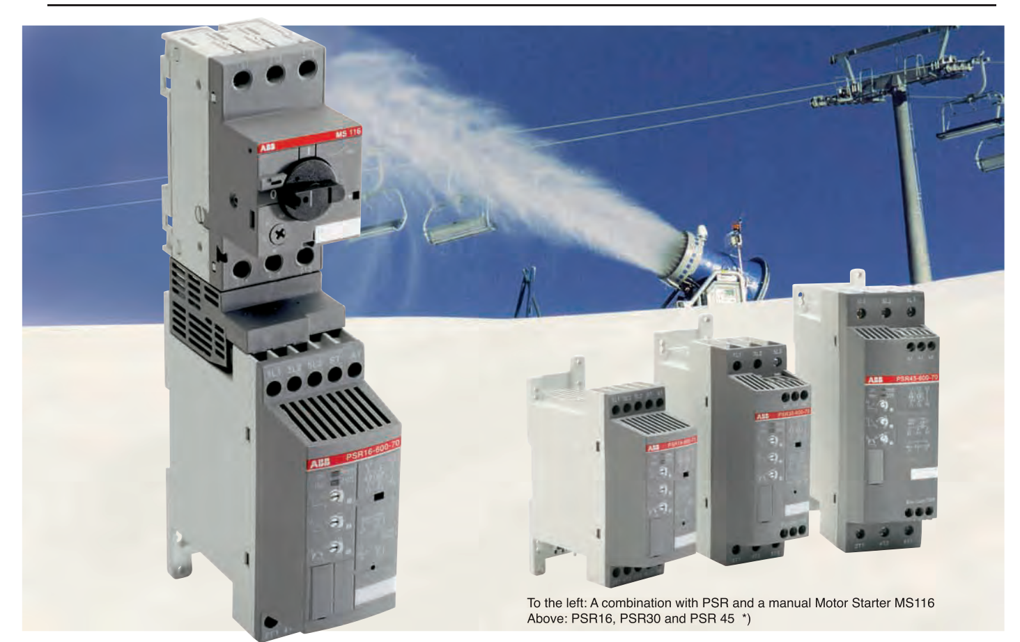
ABB Automation Products serves customer worldwide and has long experience and comprehensive know-how of the developement and production of softstarters.

After the PSS and the PST(B) ranges, it is now time to introduce the small compact PSR Softstarter - a real smart starter .