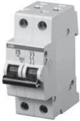
S202-D, 2 pole