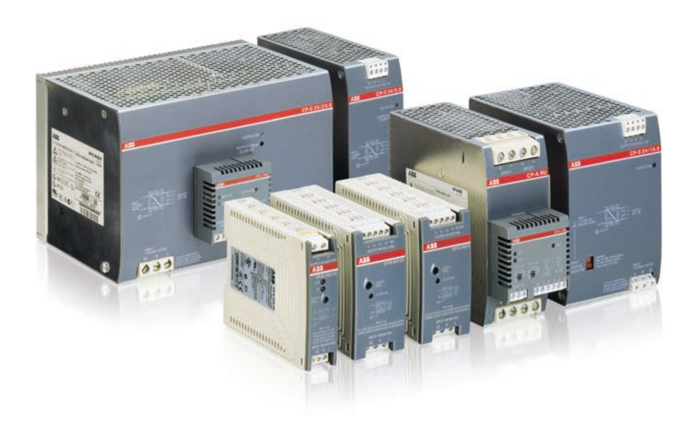
ABB power supply units: CP range

Modern power supply units are a vital component in most areas of energy management and automation technology. ABB as your global partner in these areas pays the utmost attention to the resulting requirements. Innovation is the key to a substantial enlargement of our power supply product program: