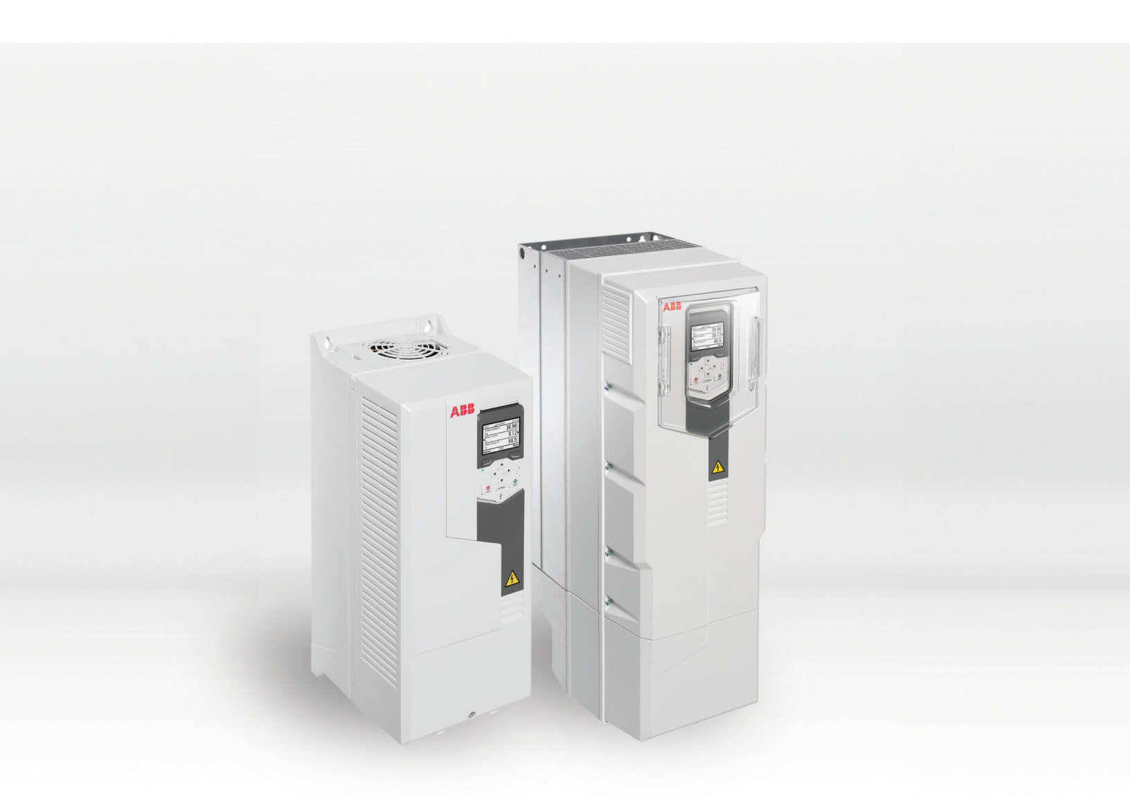
ABB general purpose drives ACS580, 1 to 350 hp