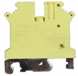
Terminal Width 5.2mm ASIUSLKG3