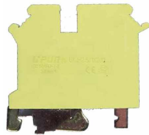
Terminal Width 6.2mm ASIUK5TWINPE