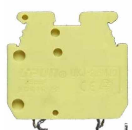
Terminal Width 5.2 mm ASIMBK3EZPE