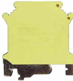
Terminal Width 5.2mm ASIUSLKG2.5N