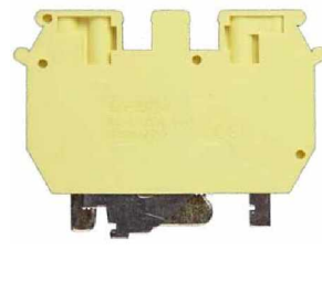
Terminal Width 6.2mm ASIUDK4PE