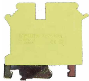
Terminal Width 5.2 mm ASIUK3TWINPE