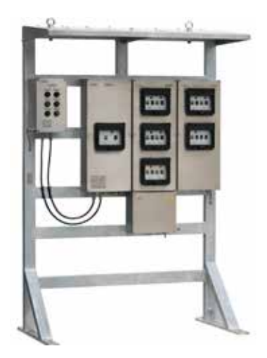
PlexPower™ IEC with stainless steel enclosure on switchrack