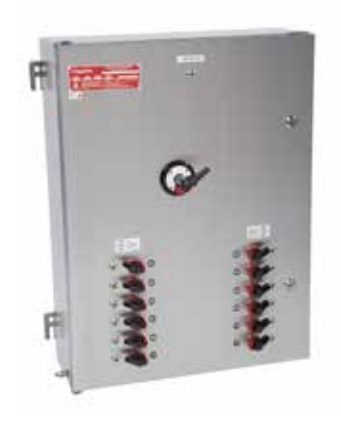
Main Breaker Module