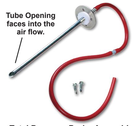
Total Pressure Probe Assembly