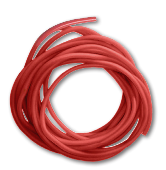
Silicone Rubber Tubing

ZPS-SIL-250-125-50 ........... 50 foot roll of silicone rubber tubing