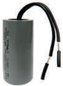
Metal Can-Type Capacitor