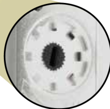
Adjustment dial to set the low-light level