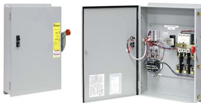
PS+ Power Module Switch for single elevator applications.

Data sheet no. 1145 (switch) 1146 (panel)