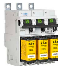
CCP2B 3-pole branch switch features lockout provision for 1/4" lock