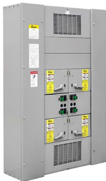
PMP+ Power Module Panel for multiple elevator applications.

† Fused main disconnect requires Class J fuses, not supplied with switch.