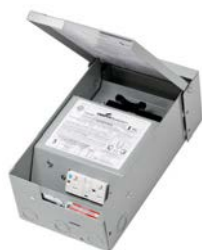
Non-fused disconnect with GFCI receptacle