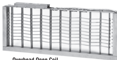
Overhead Open Coil

Commercial and Architectural Heaters are designed for use in office buildings, hospitals, schools, etc. They provide safe, uniform electric heat while providing an aesthetically pleasing design. ChromaStar radiant heaters can also be used in outdoor environments, such as loading docks.