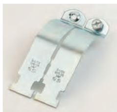
BPC-40 thru BPC-64