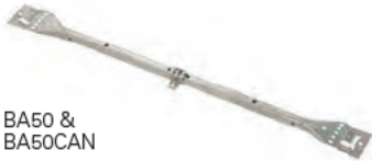
BA50 & BA50CAN