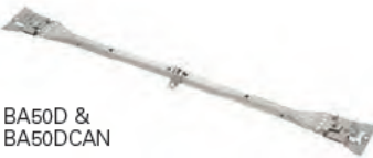
BA50D & BA50DCAN