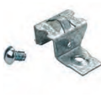
BA50C3T & BA50C4T