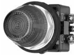
Indicating Light Unit Cat. No. HT8HFRV7

PresTest — This device incorporates a press-to-test feature whereby depressing the lens disconnects the light from the source being monitored and connects the lamp to a continuously energized circuit for immediate detection of faulty lamps.