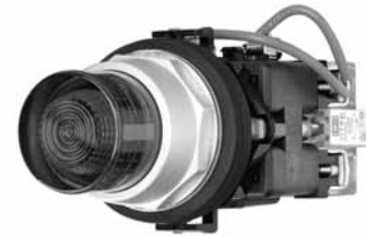
PresTest Light Unit Cat. No. HT8GTRV7