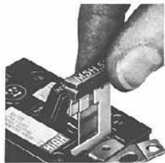
Heater Element Installation