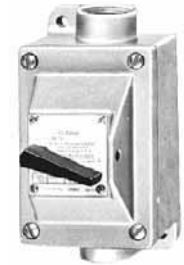
Hazardous Location Type 7D, 9E, 9F & 9G