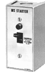
Switch and Pilot Light Mounted in Type 1 Enclosure