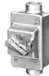
Waterproof Type 3, 4 & 5