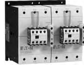
Frame F and G