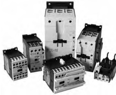
XT Family of Contactors