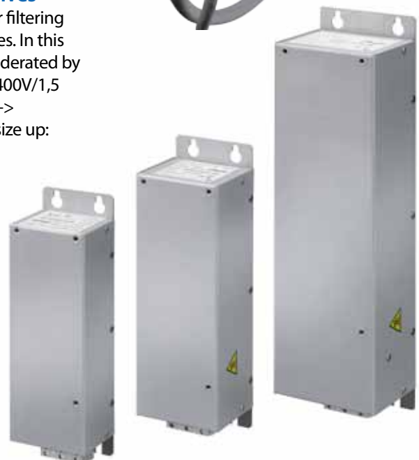
Frame sizes Three different frame sizes of line filters correspond to the M1, M2 and M3 enclosures of the VLT® Micro Drive