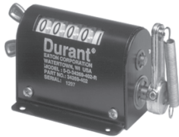
Cat. No. 5-D-1-1-R