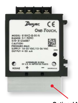
Optional NPT connection block