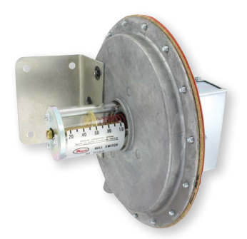
Model 1640 null switch.