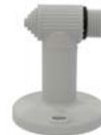
Threaded Wall Mount