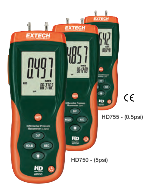
HD700 - (2psi)