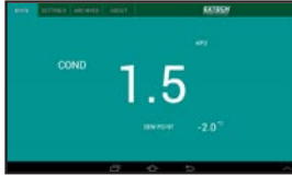
CONDENSATION / DEW POINT