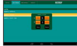
EASY TO NAVIGATE MENUS