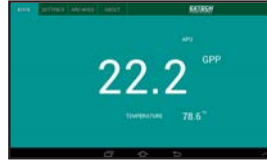
GPP / TEMPERATURE