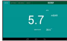
mBAR / TEMPERATURE