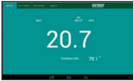
MOISTURE / TEMPERATURE