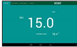
HUMIDITY / TEMPERATURE