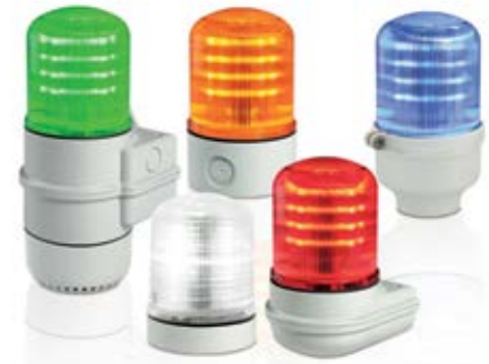
Model SLM100 shown with mounting base options (ordered separately)