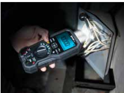
DM92 and DM93 feature powerful LED worklights