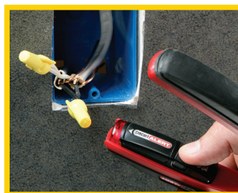
Volt Sensing (50-600 VAC)