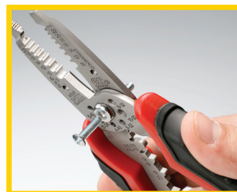
Bolt Cutting and Rethreading