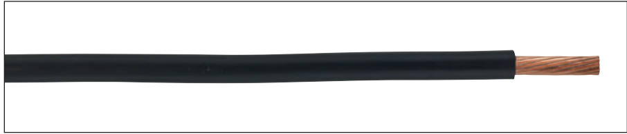
AWM, MTW, THW - 600 VOLT - UL