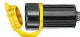
HBL60CM19 Shown with HBL6018