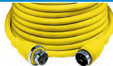
HBL61CM53 HBL61CM53W HBL61CM43