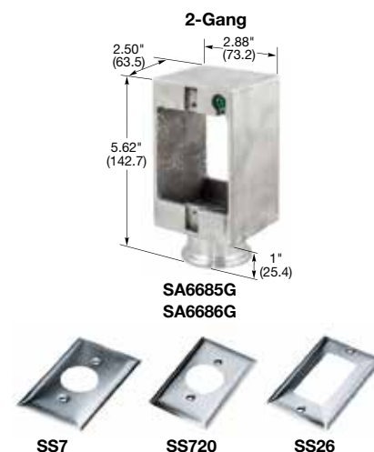
Plate Option – 1-Gang