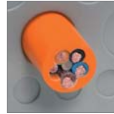
Membrane on front