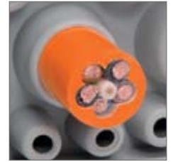
Conical shape on back provides additional sealing and strain relief