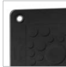
Also available in black.