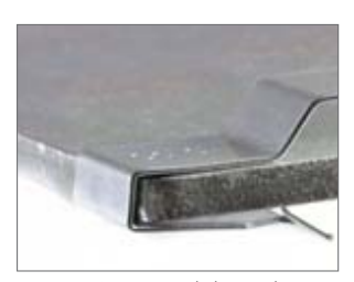
Secure grip on metal sheets due to mounting claws