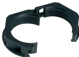
Type GMT: Split locknut