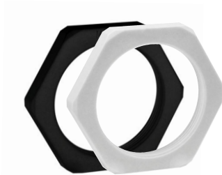
Type KGM: Standard nut, plastic