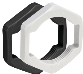
Type KGM: SUB-D9, PB, SUB-D25