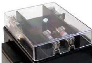
Clear Plastic Cover