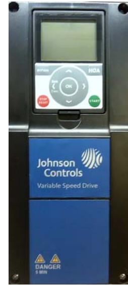
VSD Series II Variable Speed Open Drive