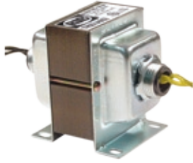
Functional Devices, Inc. A600D 2006