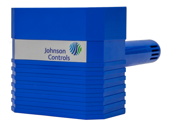
Figure 1: HE-69xx Series Duct Probe Humidity and Temperature Sensor