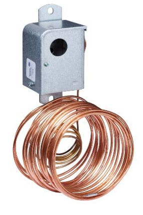
A11 Series Low Temperature Cutout Control

If the A11 Series Low Temperature Cutout Control fails to operate within its specifications, replace the unit. For a replacement control, contact the nearest Johnson Controls® representative.