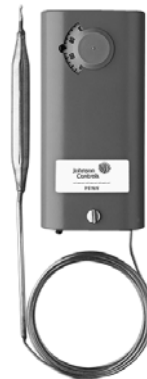
A19ABC-24 Remote Bulb Control