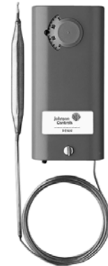
A19AAB Temperature Control