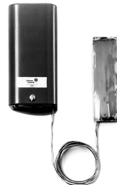
A19CAC-1 Control (Remote Bulb Model)