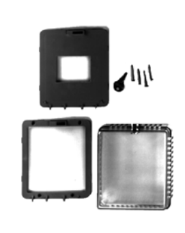
GRD10A-608 Large Clear Plastic Guard