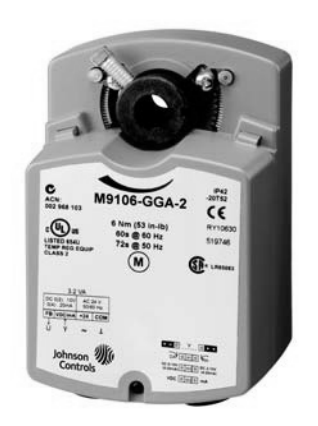
M9106-xGx-2 Series Electric Non-Spring-Return Actuator

Refer to the damper or VAV box manufacturer's information to select the proper timing for the actuator. Refer to the appropriate application note for specific wiring diagrams and information.