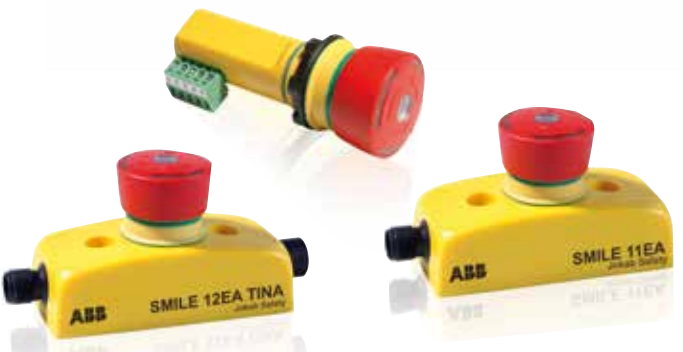
Note: Dynamic pulse safety circuits achieved when Smile interfaces with Vital Controller or Pluto safety PLC.