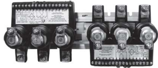
Two 3 Pole, 320A Contactors

USAVAC Vacuum Contactors mechanically interlocked suitable for use in reversing, Wye-Delta, reduced voltage auto transformer, and 2 speed single or two winding starters.