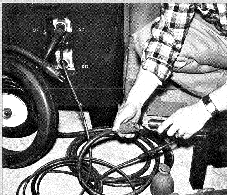
Components of an electronic testing unit are easily hooked up or taken apart for storage using Joy connectors.