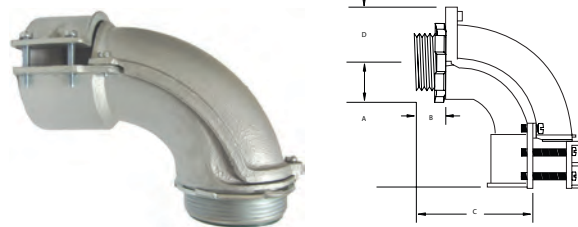
Sizes 2-1/2" - 4" are manufactured as shown on the left