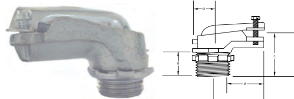
Sizes 3/8" - 3/4" are manufactured as shown above